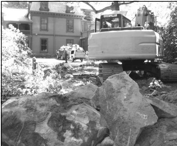
Construction crews uncovered massive boulders on the grounds of Stonehurst while installing a new water main.