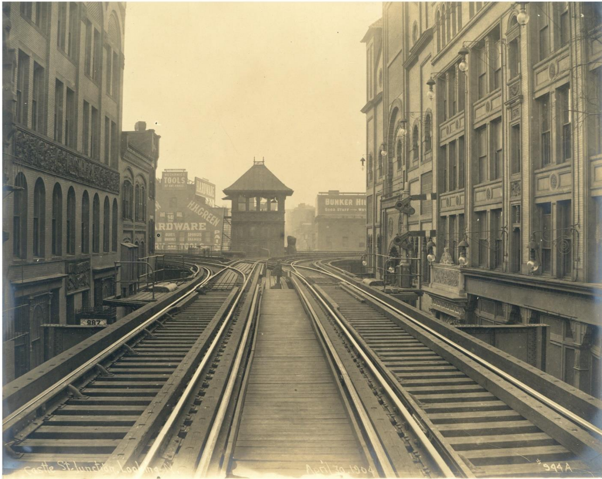
Castle Street junction looking north. The Wells Memorial Institute is visible to the left of the tracks.

The central location of the Wells Memorial in Boston's South End was largely to its advantage, although not without some challenges. The construction of the elevated railway along Washington Street changed the streetscape and led to train cars traveling directly in front of the building's windows.