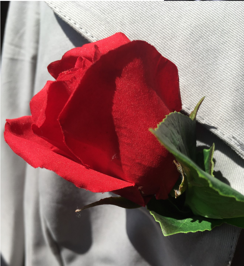
"Anxious to Vote: Students, Workers & the Fight For Women's Suffrage" • Stonehurst • Waltham Public Schools • Mass Humanities